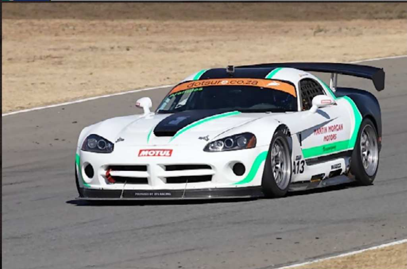
Charl Arangies / VFS Racing / Dodge Viper