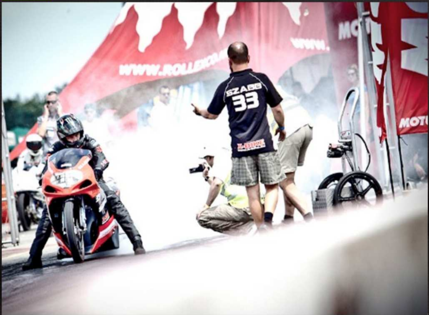
Hungarian Dragbike Championship - Motul Cup