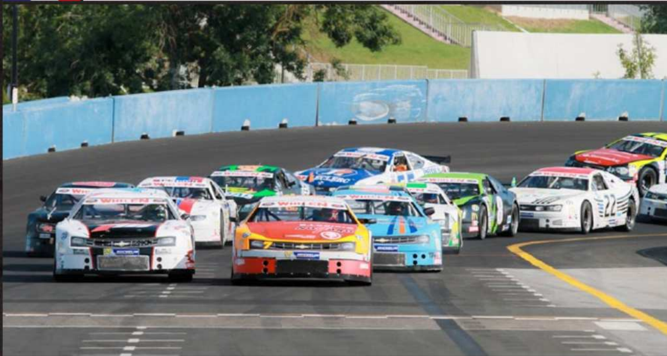
Nascar Whelen Euro Series