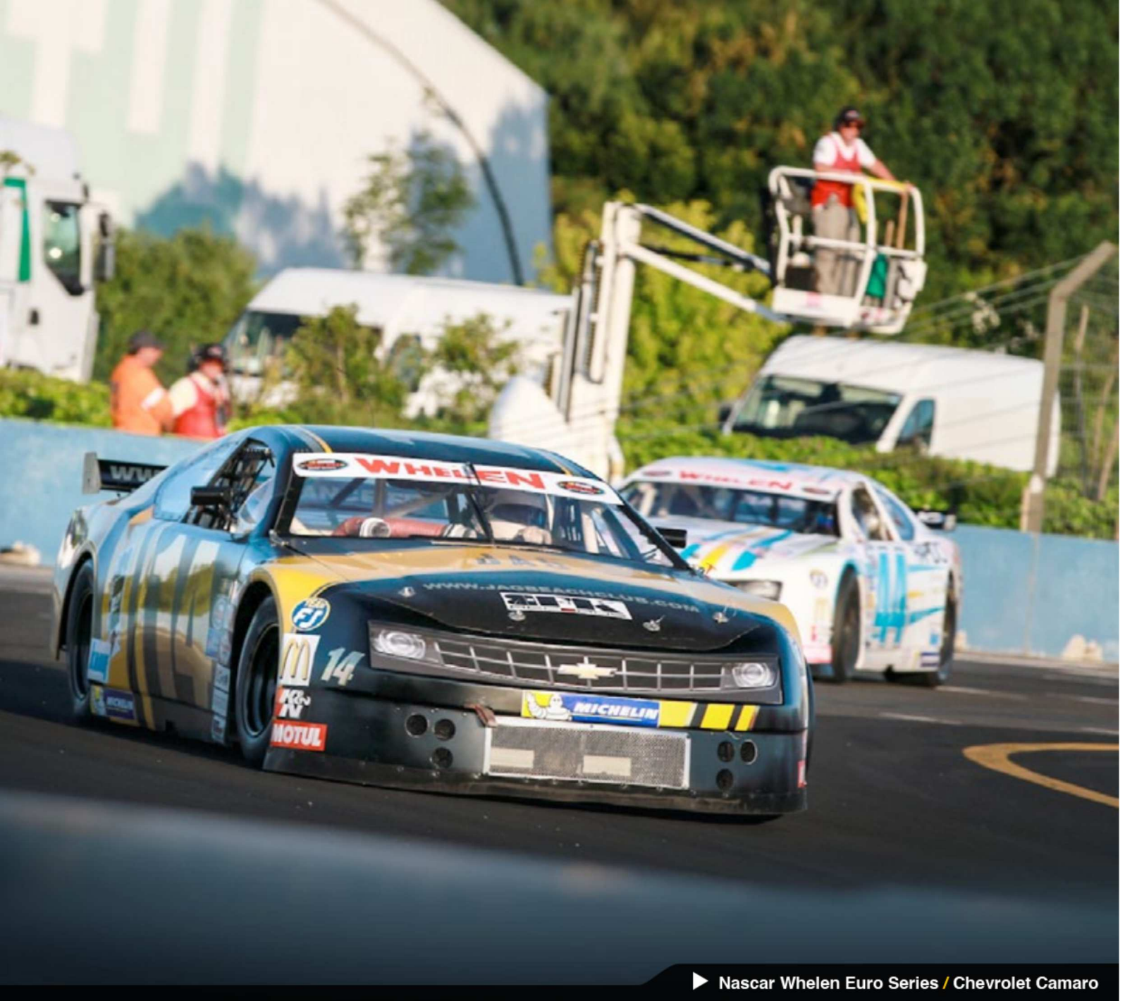
▶ Nascar Whelen Euro Series / Chevrolet Camaro