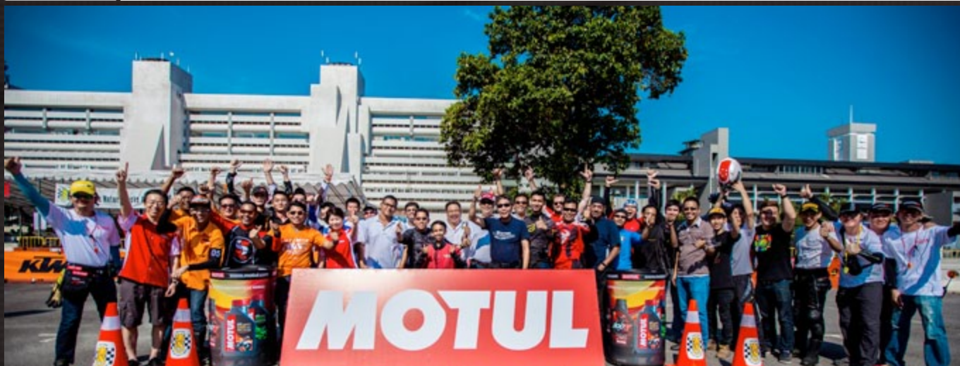
Moto Gymkhana participants