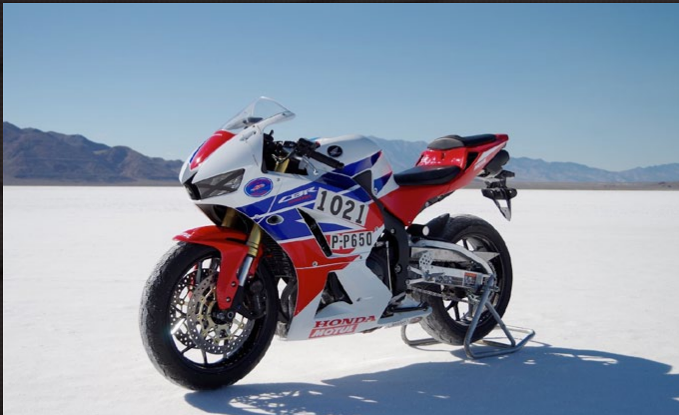
Yokohama Syunji / Honda R&D / Honda 650 CBR