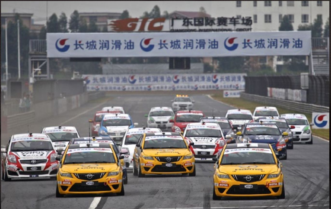
China Touring Car Championship